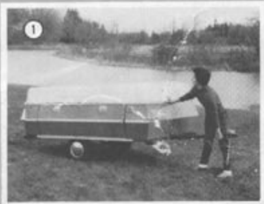
1 Wheel your Chief to the desired location.