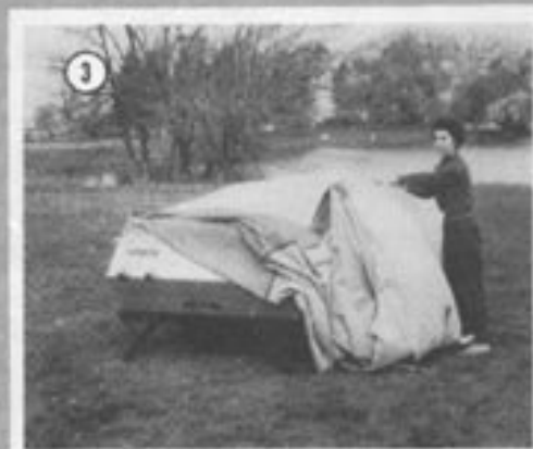
3 Slide ridge telescope bow off trailer into a vertical position beside trailer. Unzip tent door. (To eliminate vacuum.)