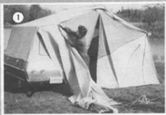
1 Stake out counter guy rope on back of tent. Zip canopy to tent.