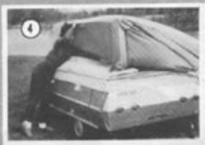
4 Pull center telescope bow down, once again folding tent under.

(Close windows on Add-A-Room.) Pull stakes and loosen all ties. Unzip option from canopy. Straighten canvas on ground under canopy. Fold twice and roll up. Untip canopy from tent and roll up.