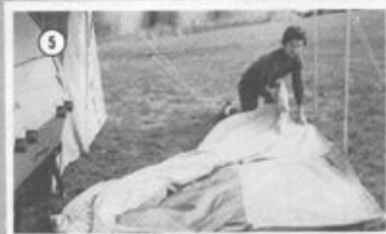
5 TO REMOVE OPTIONAL ADD-A-ROOM AND/OR SCREEN ENCLOSURE:

(Close windows on Add-A-Room.) Pull stakes and loosen all ties. Unzip option from canopy. Straighten canvas on ground under canopy. Fold twice and roll up. Untip canopy from tent and roll up.