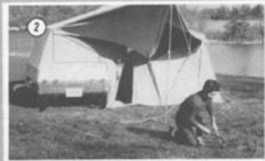
2 Assemble two piece center canopy pole and stake out. Then stake out the two outer canopy poles.