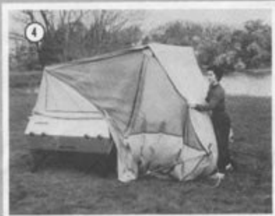
4 Grasp canvas and pull to raise center telescope bow to position.