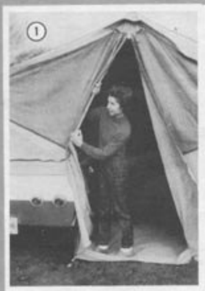
Zip up all windows. Unsnap tent where attached below storage compartment.

Release lock and slide center telescope bow together. Zip door closed. Release elastic hooks from trailer legs. Pull all stakes.