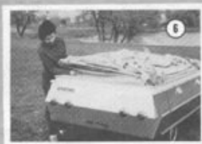
6 Fold weather flap under bow assembly. Replace road cover.