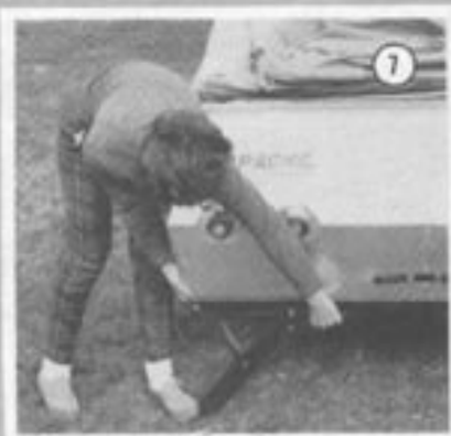
7 Release rear body leveling legs by lifting up on body corner and holding leg lock pin away from notches. Still holding pin pull leg up and lock in place. To assist in folding front legs-tilt trailer.