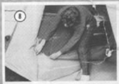
Snap tent to trailer below storage compartment.