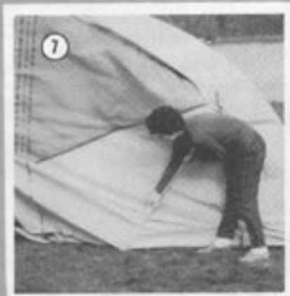
Be sure ridge telescope bow is in sleeve on side of tent, then extend bow till tent is straight. Stake out support ropes from top corners of ridge