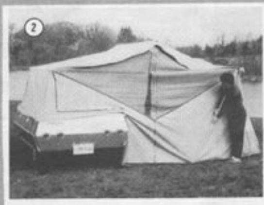
Release lock and slide ridge telescope bow together and move this assembly, with tent attached, to side of trailer.

Release lock and slide center telescope bow together. Zip door closed. Release elastic hooks from trailer legs. Pull all stakes.