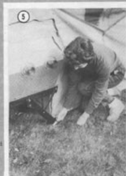
5 Attach elastic hooks, on outside corner of floor, to trailer legs. Stretch floor out from trailer and stake down.