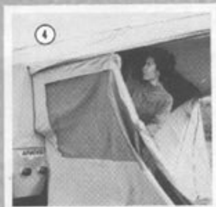
4 Zip Add-A-Room and/or screen to face of tent and to eave of canopy. Stake down two corners nearest trailer. (Slide Add-A-Room floor under tent floor.)