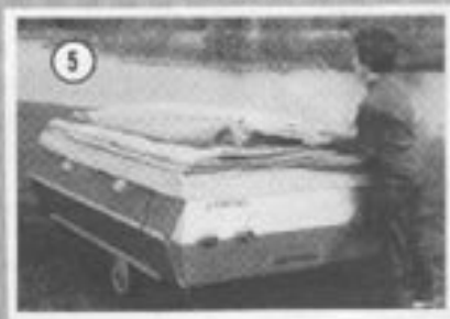
5 Fold remaining tent, with ridge telescope bow attached onto trailer.