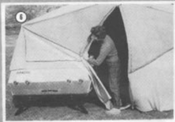
Extend center telescope bow to straighten slack from roof over bed.