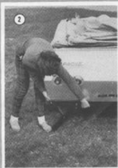
2 Release and position front body legs to 7th notch. To position rear legs, release and push down to ground level. To adjust trailer body, place foot on leg base, lift up slightly on trailer corner and bring leg lock pin to a notch or two higher, leveling trailer. Remove travel cover.