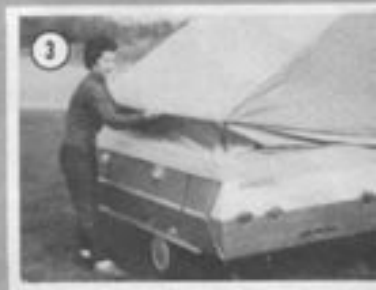
Pull hip bow down to trailer folding tent under.