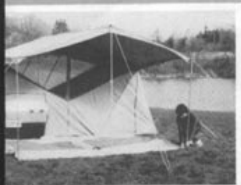
3 Zip out Add-A-Room and/or screen under with screen door lined up with center pole. Secure grommet tabs under poles.